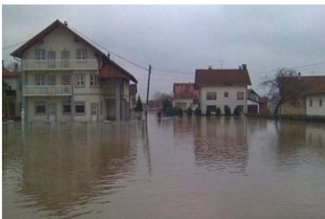
Flood affected village in Bijeljina.

Summary: Due to the heavy rain in Montenegro, Bosnia and Herzegovina/ Republic of Srpska, the water level in river Drina has been on a steady increase since 1 st December until 3 rd December, with water spilling out of the river beds and flooding the houses, buildings and agricultural land. In Bosnia and Herzegovina 5,806 households (approximately 20,000 people) have been affected by the flooding.