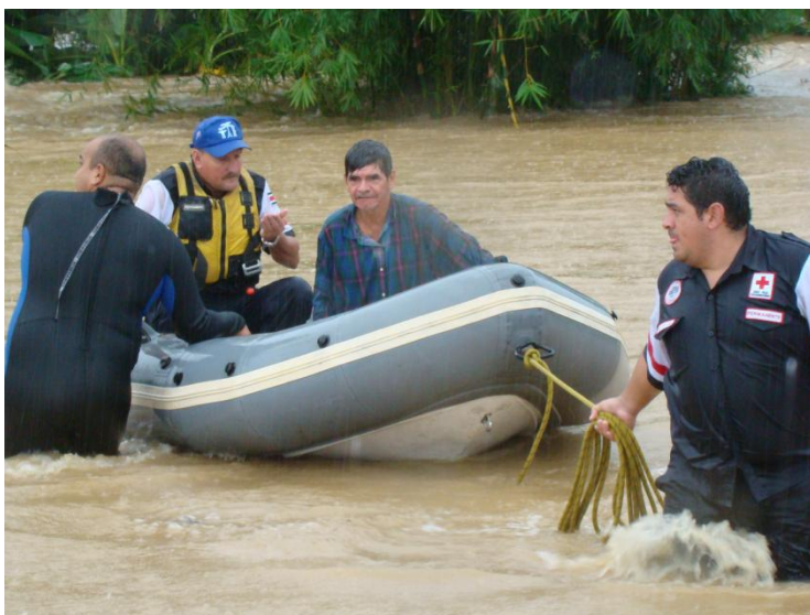
The Costa Rican Red Cross has carried out some 60 aquatic rescues since the onset of the current emergency.

Since the early morning of Wednesday, 1 December 2010, intense rains have fallen across the Caribbean and northern regions of Costa Rica, resulting in overflowing of rivers and affecting more than 200 communities. Early assessments by the Costa Rican Red Cross estimate that some 13,500 people are affected and 3,474 are staying in 48 collective centres.