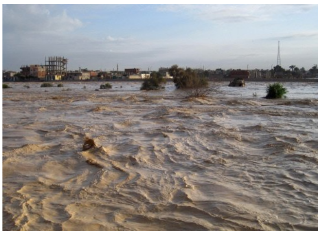
Heavy rainfall has caused floods across Egypt including Al Arish, the area close to the border with Gaza.

Heavy wind and rains affected parts of Egypt, the Gaza Strip, Israel and Jordan since 18 January, sweeping away homes, knocking out power lines and cutting roads. Torrential rains in Egypt have claimed the lives of 12 people, left many injured and hundreds displaced by rain-induced flooding in the Sinai Peninsula, the Red Sea port of Hurghada and Aswan Governorate in southern Egypt. A great number of houses in four regions in Egypt (North Sinai, South Sinai, Red Sea and Aswan) have been severely hit by these flash floods. Some 3,500 persons (500 households) have been evacuated. The heavy rains are expected to continue in the next few days with storms moving north and west towards Cairo and the Mediterranean coast. Access to the flooded areas remains a challenge for emergency workers due to roads being submerged.