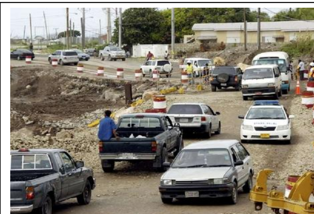
Heavy rains caused Hope River to wash away the ford which links to Harbour View to Bull Bay.

Although the entire island of Jamaica was affected by Tropical Storm Nicole, information from the initial damage and needs assessment conducted by the Jamaica Red Cross has determined the communities that received the greatest impact. These communities have been identified in ten parishes: Clarendon, Saint Catherine, Saint James, Hanover, Saint Mary, Saint Elizabeth, Saint Ann, Kingston, Saint Andrew and Westmoreland.