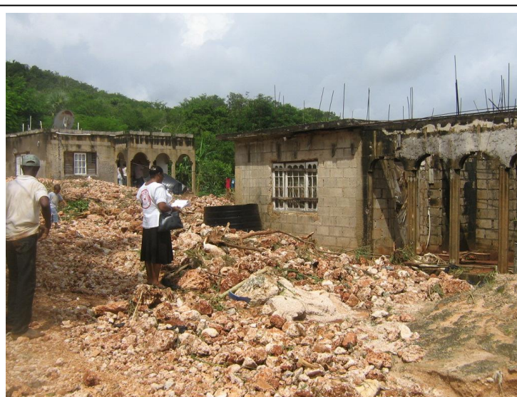
Jamaica Red Cross volunteer conducting assessment of a collapsed house

Tropical Storm Nicole developed rapidly on 28 September and passed through the Cayman Islands, Jamaica, Cuba and the Bahamas bringing heavy rain and winds. The island of Jamaica received rain and