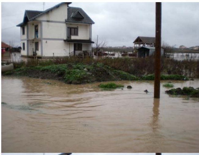
Flood affected village in Viti/Vitine, Kosovo. Picture taken by a Red Cross volunteer.

Summary: Due to the heavy rainfalls in Kosovo as in many countries in Balkans, many villages in Kosovo, some of them in the rural and poorer part, have been flooded. Rivers that caused floods were Morava e Binçes, Kaqareva, Krena, Ereniku, Prishtevka. An estimated 850 households have been affected by the flooding.