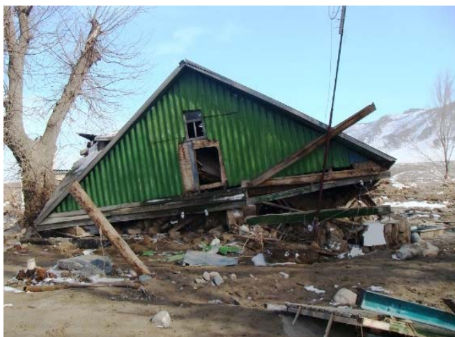
One of the many houses in Kyzylagash village that has been destroyed.

Summary: On 11 and 12 March 2010 floods hit again the Almaty region as a consequence of the plentiful precipitation (snow and rain) and the sharp rise in the temperature that triggered the snow melting. On the evening of 12 March four settlements were completely flooded and another eight settlements partially flooded in addition to the number of flooded farms. In total about 1,500 residential houses were flooded, part of them completely destroyed. Around 10,000 people had to be temporarily resettled to safe locations.