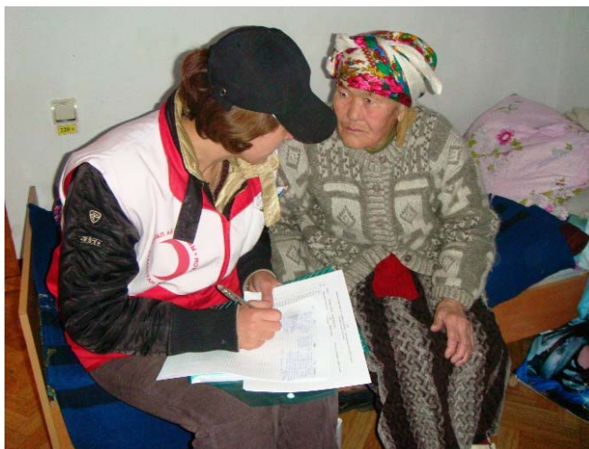
The Red Crescent distributed bedding sets, blankets, buckets, towels and hygiene items for the people accommodated in the military barracks.