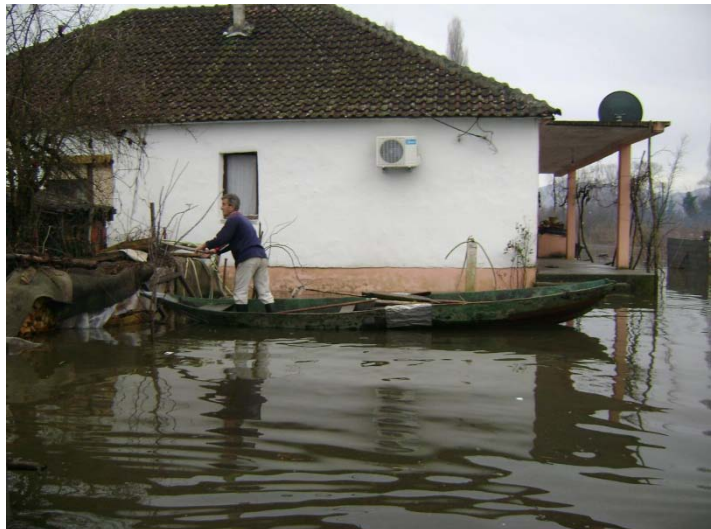
Severe flooding hit parts of Montenegro after weeks of sustained rainfall.

Summary: Extreme rainfall, which began in December last year and has continued up to 10 January 2010, has caused serious material damage. A great number of houses in the area surrounding Lake Skadar, the municipalities of Ulcinj, the vicinity of River Bojana, the municipality of Golubovci, Zeta, the municipality of Cetinje, Rijeka Crnojevica, Zabljak Crnojevica, Bjolopavlici plain and the municipality of Niksici have been flooded. Some 1,100 persons, or 245 households, have had to be evacuated.