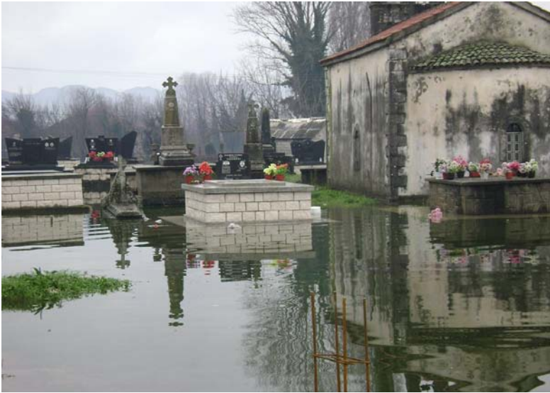
Cemeteries were also affected by the flooding.

Water levels are still increasing, and if this continues, may cause more serious humanitarian consequences, not only for the inhabitants of the endangered areas, but also for people living in the municipality of Golubovci, where the level of the River Moraca is also rising.