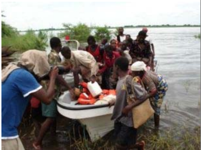
CVM volunteers helping people distributing relief items to the affected people

Summary: Parts of Mozambique experienced heavy rainfall since mid February 2010, mainly in the central region covering Zambézia, Tete, Manica and Sofala Provinces. The persistent rains have saturated the soil causing floods in the valleys of Buzi, Zambézia, Licungo, Save and other rivers affecting approximately 17,000 people. The rainy situation has also been experienced in the neighbouring countries of Malawi, Zambia and Zimbabwe.