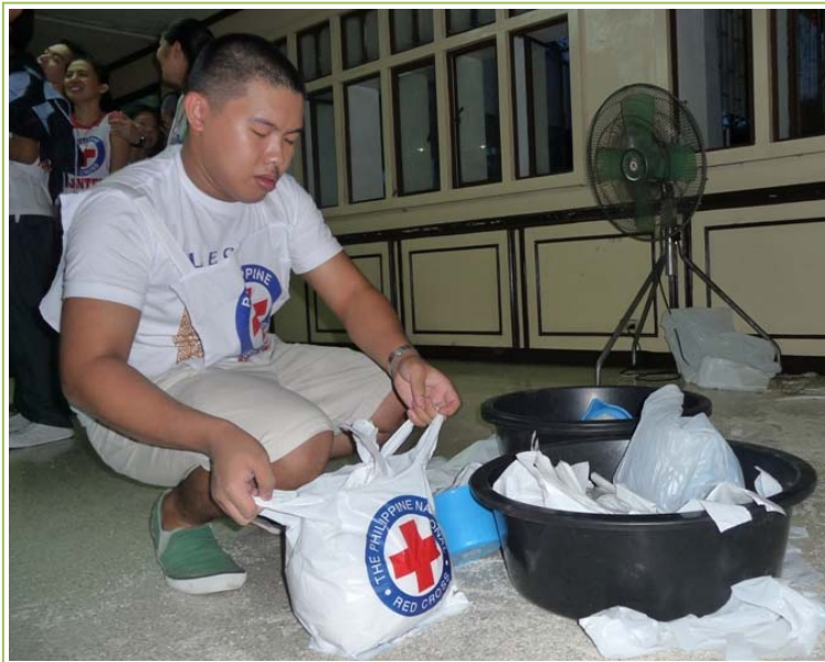
A volunteer readies supplies. PRC has provided food and non-food items to some 1,700 families in evacuation centres.

Based on its mandate – of providing humanitarian services in times of emergency and disaster – as auxiliary to the authorities, PRC acted even before the typhoon made landfall. The National Society complemented pre-disaster procedures put in place by national, regional and local disaster risk reduction and management councils, including pre-emptive evacuation. It also participated in NDRRMC meetings, to discuss preparedness and response measures, as it is a member agency. PRC disseminated information on measures that communities should take before, during and after the storm. In addition, the National Society deployed a water search and rescue (WASAR) team to Cagayan, with additional teams on standby at the national headquarters and Isabela, La Union, Olongapo, Pangasinan and Zambales chapters.