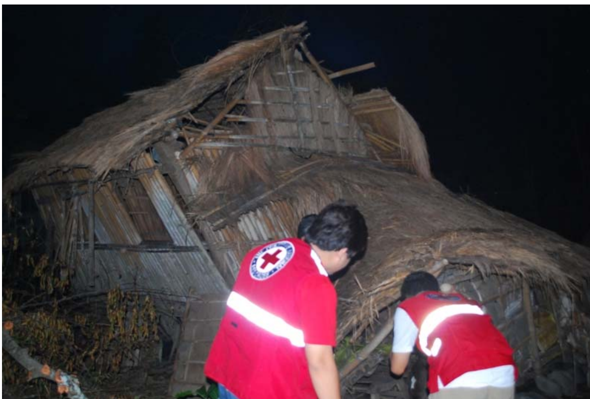
Joint Red Cross Red Crescent teams are on the ground surveying the extent of the damage and the needs. They comprise members from PRC, IFRC, German Red Cross and Spanish Red Cross. One team was in Isabela, where 24,203 houses have been destroyed and 44,836 damaged.

CHF 214,855 has been allocated from the IFRC's Disaster Relief Emergency Fund (DREF) to support the Philippine Red Cross (PRC) in delivering immediate assistance to support the national society in conducting needs assessments and delivering immediate assistance to some 3,000 families (15,000 persons). Unearmarked funds to repay DREF are encouraged.