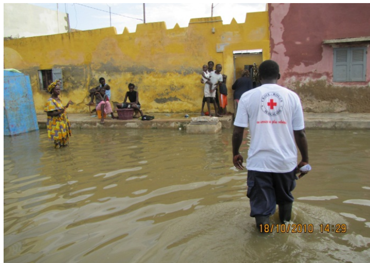
A Red volunteer in the flooded communities during the assessment/ of the affected people

Summary: Saint-Louis and surrounding areas experienced extensive flooding, which caused human displacement and destroyed existing infrastructure. The flooding was caused by two-day rainfall received on 17 and 18 October 2010. This occurred immediately after the heavy downpour experienced in August and September 2010. The flooding blocked the drainage system, washed away toilets and contaminated water sources causing significant threats of water-borne and vector-borne diseases. Seventy-five houses collapsed injuring two people and 4,345 households were left without sanitation facilities as a result of the flooding. Overall, 5,661 households were affected. In order to avoid any disease outbreaks, the local authorities provided drinkable water to the affected communities.