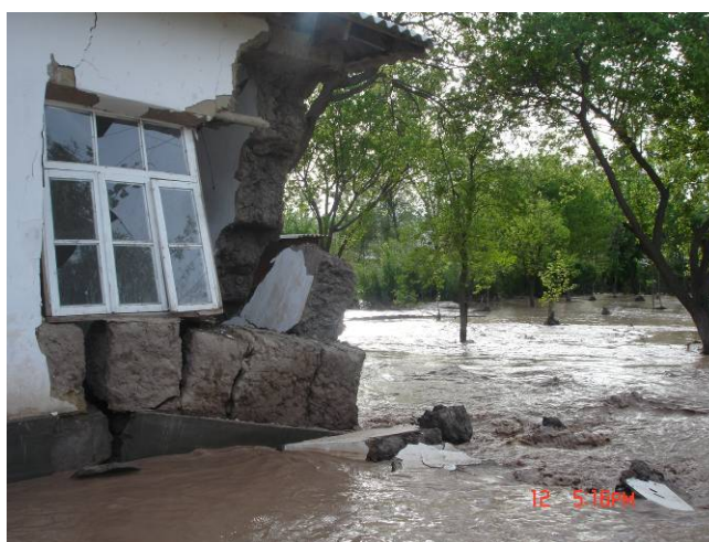
Damaged houses in Vose district.

Summary: As a result of heavy rains on 11 April 2010, floods occurred and affected 18 villages throughout the country. In total 319 houses (with 1,914 inhabitants) have been damaged, out of which 5 houses totally destroyed. Two people were killed by the floods. Besides the 18 affected villages, more than 10 villages are under the risk of flooding and landslide. In addition, 4 schools, 9 bridges, and 5 kms of internal roads have been damaged and 10 heads of livestock died. The National Society will assist the 120 most affected households through the distribution of basic non-food items to help them cope with the consequences of the disaster.