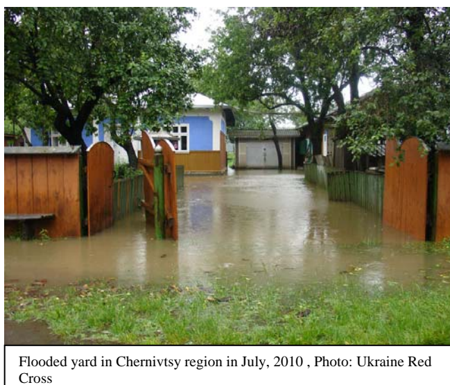
Flooded yard in Chernivtsy region in July, 2010

Due to heavy rains at the end of June, and the consequent rise in river levels, more than 1,000 houses have been flooded in Chernivtsy and Ivano-Frankivsk regions though affecting a total of 65,000 people. The severe weather damaged 1,841 hectares of agricultural land, 36 main roads and 16 foot-bridges. Large amounts of crops have been destroyed, affecting current and future economic and food security, as vegetables grown during the summer months are picked and stored for winter use. The economic impact will be exacerbated through the loss of livestock, electrical equipments and personal possessions. 1