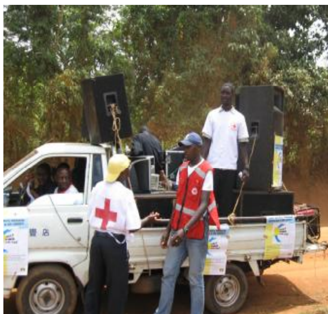
URCS Volunteers conducting a mobilization exercise

<click here for the DREF budget, here for contact details, or here to view the map of the affected area>