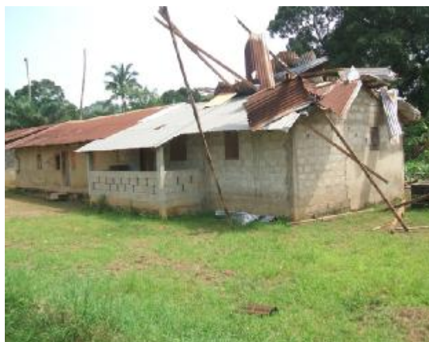
Many houses like this one have been destroyed in four localities of Gabon

CHF 96,960 (USD 100,601 or EUR 75,156) has been allocated from the Federation's Disaster Relief Emergency Fund (DREF) to support the Gabonese Red Cross Society in delivering immediate assistance to some 203 families, i.e. 1,015 beneficiaries. Un-earmarked funds to repay DREF are encouraged.