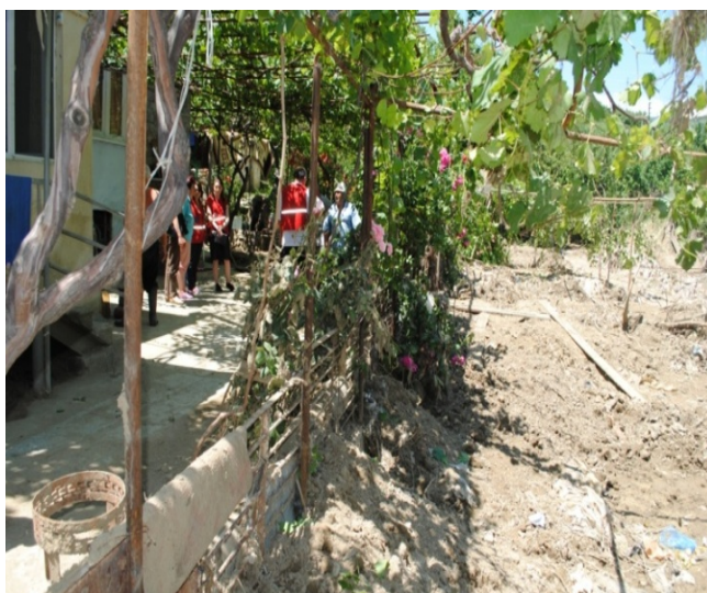
Georgia Red Cross Assessment team evaluating a flooded house.

Summary: In Western and Eastern Georgia many regions were affected by unceasing rains from 12 to 22 June 2011 with landslides that followed. Seven people lost their lives. Over 3,000 houses have been affected, out of which 1,500 are badly damaged. The ground floors of 350 houses are still inundated and not suitable for staying in them. On top of that, the mudslide and the water have damaged farmlands, roads, bridges, canals, water pipe system and communication network. The residents have been cut off from the water and gas utility system. The water has swept away several roads, leaving many settlements isolated. On many farms, the cattle and poultry got killed. The Georgia Red Cross Society aims to assist 350 families, or approximately 1,750 people, with mattresses, blankets and hygiene parcels in Shida Kartli Region (Surami, Khashuri) which is situated 145 km from Tbilisi to the west, and Dusheti Municipality 65 km from Tbilisi to the north.