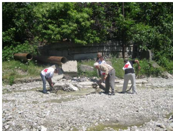
Georgia Red Cross volunteers are cleaning the water canal.

Georgia Red Cross Society Disaster Management Team consisting of staff members from HQ and Branches went for preliminary needs assessment to the village Giorgitsminda which is located in the Gldani-Nazaladevi district in Tbilisi (population: about 700 families) and Chartali Community of Dusheti Municipality (population: about 315 families). The needs assessment trip included meetings with the local authorities and local residents. The team has visited places and households affected by the natural disasters in the last 10 days. In the assessment area there are 300 families, whose dwellings are badly damaged and 80 families, who are suffering from inappropriate living conditions. In the villages there is a huge problem of water supply and sanitation, which