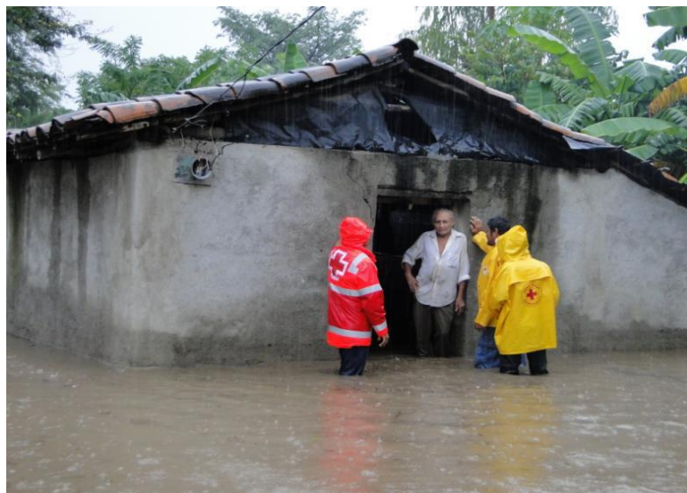
HRC volunteers and technical personnel have conducted search, rescue and evacuation activities of the population affected by flooding.

State of Emergency, but damages are concentrated in the Choluteca and Valle departments.