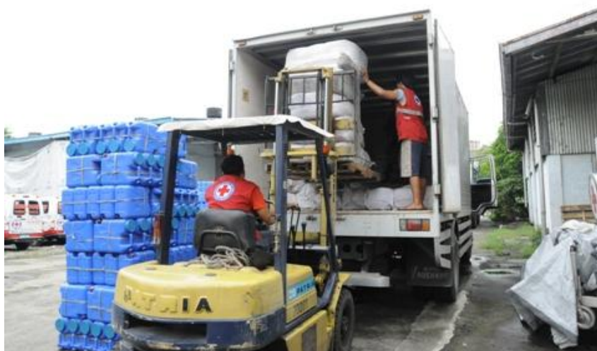
Relief supplies are loaded for dispatch to affected areas. To date, Philippine Red Cross has distributed non-food packages to more than 2,000 families.

Summary: Some 12 days after Typhoons Nesat and Nalgae hit the Philippines, and five days after the International Federation of Red Cross and Red Crescent (IFRC) launched a preliminary emergency appeal to support the Philippine Red Cross (PRC) in assisting 50,000 families (250,000 persons), the relief response has intensified. Drawing largely on the CHF 280,000 initially allocated from DREF, the national society has distributed food rations to 22,000 families and non-food materials to more than 2,000 families. Distributions continue, with additional supplies dispatched from the capital, Manila, for affected areas.