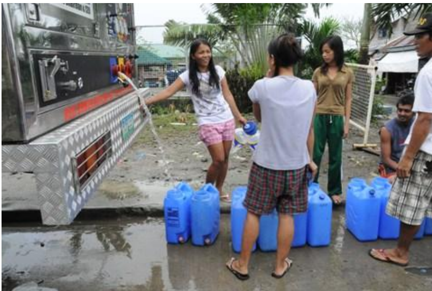
Over the weekend, a Philippine Red Cross water truck was used to distribute clean, drinking water to residents of Calumpit, Bulacan.

PRC has been active since before Typhoon Nesat made landfall. As it approached, the organization issued a series of advisories and early warnings to its chapters. Once the storm hit, PRC activated specialized response units that managed to ferry more than 2,500 people to evacuation shelters and water search-and-rescue teams that took around 2,600 trapped persons to safety. PRC also acted swiftly to rescue those affected by Typhoon Nalgae, which followed days after Nesat. In total, more than 2,300 Red Cross volunteers and 200 staff have been involved in the days since Nesat and Nalgae struck. They have served more than 21,000 evacuees with ready-to-eat meals, and are manning welfare desks and providing psychosocial support in evacuation centres. Additionally, food rations for