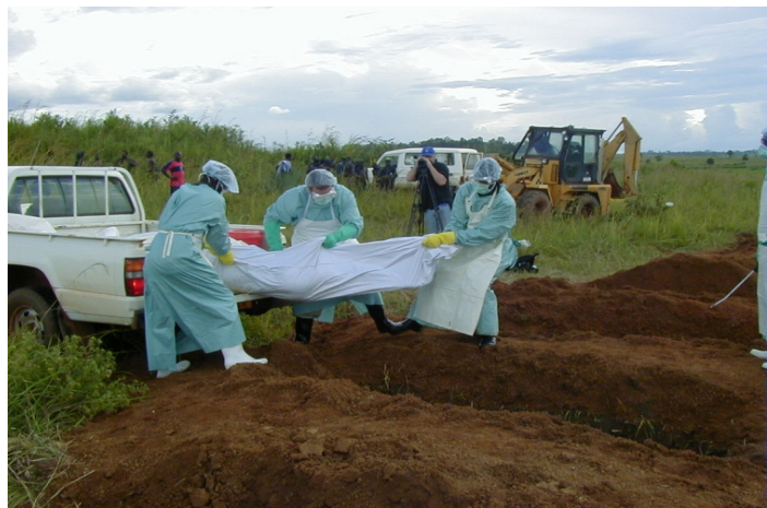
URCS volunteers burying a person who died from Ebola Disease.

This operation was implemented for 3 months starting from 18 May 2011 and was completed on 19 August 2011. A joint final evaluation meeting was conducted by the Ministry of Health (MoH) on 1-2 September 2011. During this period, the Uganda Red Cross Society (URCS) was involved in key Ebola response activities with other implementing partners as well as the government. Activities carried out included: community sensitization on Ebola, house to house campaigns as well as media campaigns. In addition, case contacts, follow ups and referrals, as well as health promotion and education through Information, Education and Communication (IEC) were carried out. All the planned activities were implemented according to plan. The National Society was able to reach the targeted population, thanks to UNICEF for additional support in training more volunteers.