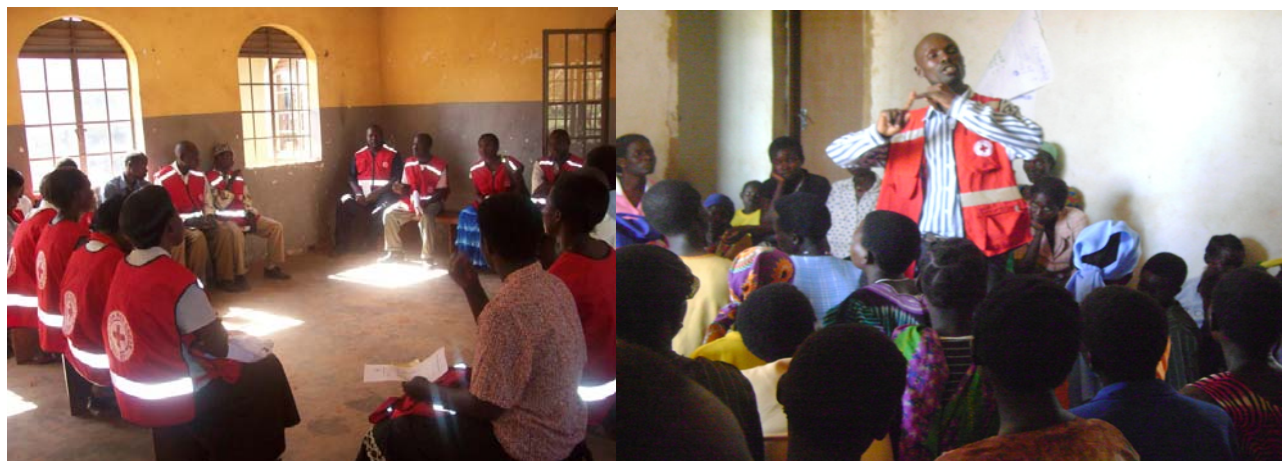
Photo left: A group of volunteers in Zirowwe during orientation. Photo right: A volunteer educating women during community meeting in Kampala

The National Society, through its trained volunteers was able to reach the targeted population in the 5 districts with awareness messages on Ebola prevention. Since URCS was able to train 125% of the targeted Village Health Teams (VHTs)/community based volunteers as a result of additional support from UNICEF, it was in turn able to conduct 153% of the targeted door to door sessions.