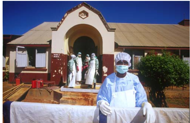
URCS volunteers responding to the HEV outbreak.

Summary: The Ministry of Health has declared an epidemic of Hepatitis E Virus (HEV) in Karamoja sub-region of North Eastern Uganda, having recorded 120 cases of Hepatitis E over the last 4 weeks. This case load is increasing with 33 new cases reported last 1 week. The case fatality rate has been 1.9%.