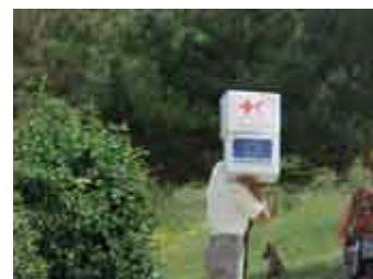
Information bulletin at

A total of 195,500 Meals Ready to Eat (MRE's) that were kept as a contingency were delivered to the local branches to be further distributed to the beneficiaries, since their expiry date was approaching. Heavy rainfalls in December caused floods in the country, especially in the Skopje area. Approximately 500 families were directly affected by the disaster and because of the scale of the emergency, the National Society released an Information Bulletin together with the Federation. Refer to http://www.ifrc.org/where/country/cn6.asp?countryid=108