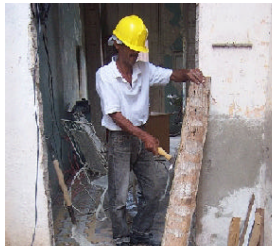
As part of the Cuban Red Cross's capacity building project, branch offices throughout the country were renovated and equipped with improved sanitation systems. Some branches also received computers and printers.