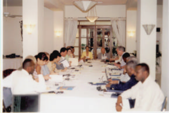
A partnership meeting for the Haitian National Red Cross Society was held in August. The meeting provided the National Society with the opportunity to explain its long-term strategy and presents its programme objectives.

the American, Dominican, French, Netherlands and Norwegian Red Cross Societies. In addition, representatives of the Regional Delegation in Panama, the Americas Department of the Secretariat in Geneva and the ICRC office in Port-au-Prince were present.