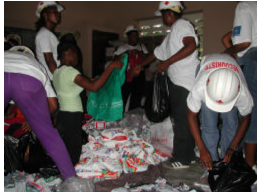
Thanks to the regional container project, the Haitian Red Cross was able to provide relief to 300 families.

In Haiti, heavy rains resulted in flooding in late August in St. Marc, in Bas Artibonite. Thousands of residents of the areas lost all of their belongings. Thanks to the container that had been positioned in the province, the Haitian National Red Cross Society was able to provide relief to 300 affected families. This operation demonstrated the capacity of the Haitian Red Cross National Society to respond effectively in an emergency. The National Society worked closely with the regional branch of Saint-Marc and many branch members worked as volunteers during the relief operations. These and other volunteers played a very important role in identifying flooded areas, interviewing disaster victims and distributing relief goods. The success of this operation was largely a result of the hands-on approach of the volunteers in the region.