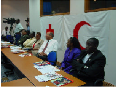
The September partnership meeting in Barbados incorporated the launch of the World Disaster Report and the "Together We Can" peer education manual.

CCORC members. This progress will be taken further with a proposed second partnership meeting in Trinidad in December and a specific concentration on World AIDS Day.