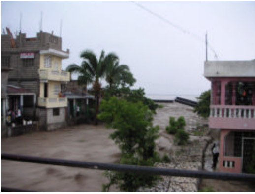
Heavy rains resulted in flooding in St. Marc, Haiti. Thousands of residents lost all of their belongings.