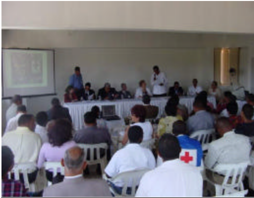
National Society elections were held during the general assembly of the Dominican Red Cross in August.

participants in “emotionally intelligent leadership,” encouraging senior figures from the region to analyze their management and governance approaches and become more rounded leaders.