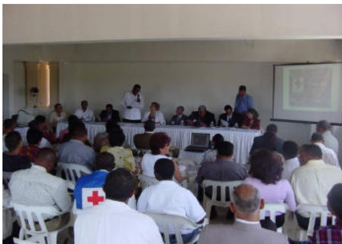
National Society elections were held during the General Assembly of the Dominican Red Cross in August.