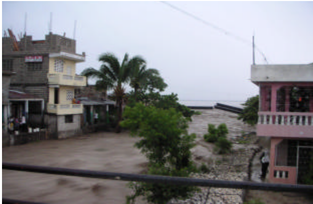
Heavy rains resulted in flooding in St. Marc, Haiti. Thousands of residents lost all of their belongings.