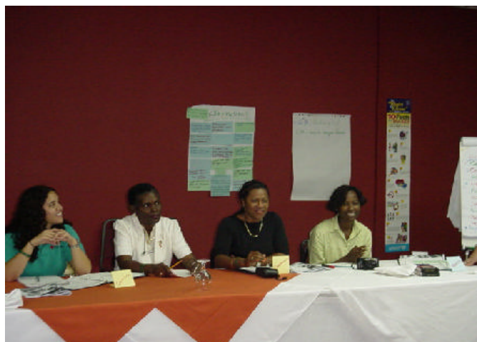
Participants in the Together We Can workshop in Santo Domingo