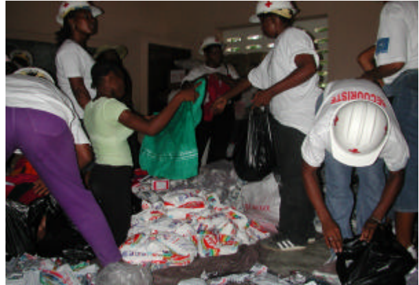
Thanks to the regional container project, the Haitian Red Cross was able to provide relief to 300 families.