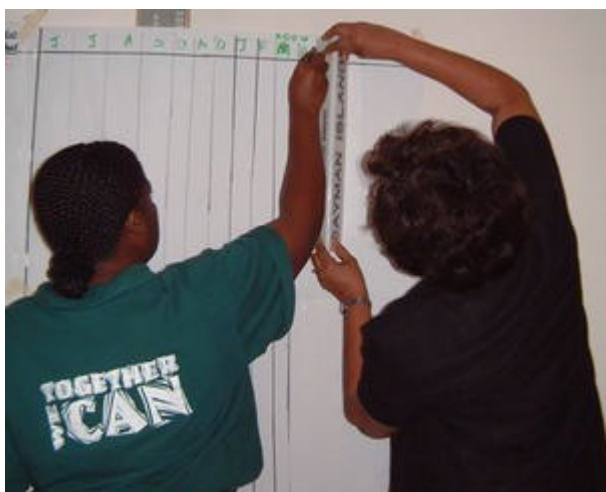
Planning working group for HIV/AIDS