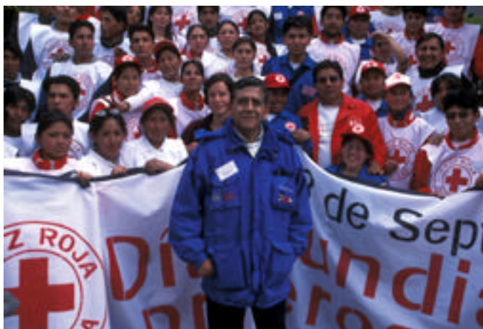
Volunteers from the Bolivian Red Cross took to the streets to celebrate and promote World First Aid Day on September 13.