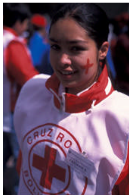
In 2003, the Red Cross Youth Network led the work of the Federation in the anti-stigma HIV/AIDS campaign.