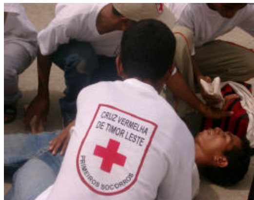
Volunteers practicing first aid

CVTL regularly publicised articles on health issues in East Timor's only magazine for children, Lafaek (also read by adults).