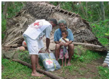
Fiji Red Cross volunteers in action

During the second week of the year, cyclone Ami caused extensive damage in Fiji, especially on the second largest island of Vanua Levu. The Fiji Red Cross Society responded quickly and effectively and the Federation launched an international emergency appeal in support, focussing on water and sanitation, school repairs, replenishment of relief stock and the further strengthening of response capacity, including training of staff and volunteers. Relief and rehabilitation operations were completed by the end of June. The Solomon Islands Red Cross Society participated in the joint assessment and relief mission to Tikopia following cyclone Zoe. Later in the year, it also provided humanitarian relief to those affected by internal conflict, including displaced people in Honiara and on the Weathercoast. This operation was supported throughout by the ICRC which re-opened its Honiara office in August. Elsewhere in the region, the Red Cross also responded to minor emergencies including local floods, storms, landslides and fires.