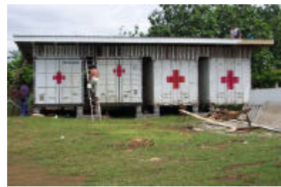
Samoa Red Cross Society – Repair and relocation of disaster preparedness containers to the new Red Cross compound.