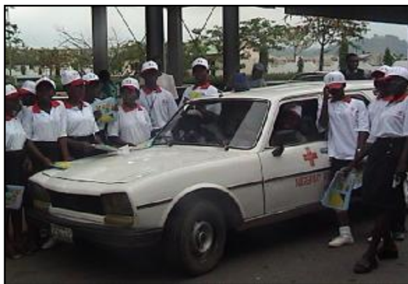
Nigerian Red Cross peer educators attending a HIV/AIDS conference