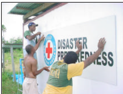
Figure 2 - FIJI: putting the final touches to a DP container

The pre-positioning of basic emergency relief supplies in containers across the region has contributed to fast and effective emergency response, as demonstrated most recently by the Fiji Red Cross following cyclone Ami in January 2003. There are currently 63 containers spread out over strategic locations in 12 countries, and 2004 will see a further consolidation of this component through maintenance and training as well as limited expansion.