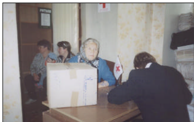
Russian Red Cross distributions of food parcels provide invaluable support to some of Russia's most vulnerable elderly people

Activities targeting HIV/AIDS prevention among intra-venous drug-users through harm reduction initiatives and social and psychological support to vulnerable children have not been initiated due to the lack of funding. Russian Red Cross continues to fundraise through the International Federation, international and local donors to enable their implementation.