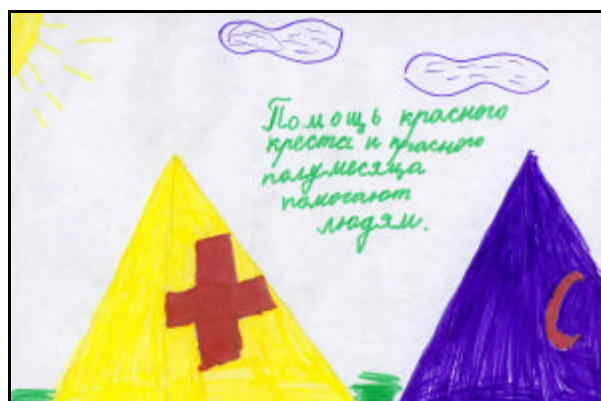
"Help the Red Cross and Red Crescent to help others." At summer camps, children learn about the history of the Red Cross Red Crescent Movement and its role in society

During the reporting period, all RRC branches worked in close cooperation with territorial Ministry of Interior Migration departments, and other local NGOs providing assistance to undocumented migrants. All RRC activities were widely broadcast in the local mass media and RRC staff distributed promotional materials on activities at RRC branches, railway stations, government and non government centres for passport/visa services, AIDS centres, accommodation centres for involuntary migrants.