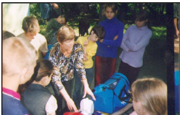
Russian Red Cross teach first aid at summer camps as part of a programme designed to encourage integration between migrant and local children

RRC psychologists will continue to support children who attended the camps throughout the coming year and record the impact of the summer camp on the participants.