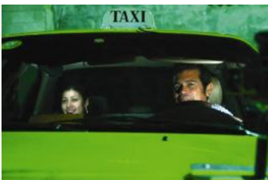
Taxi drivers in San Salvador raising awareness and respect for PLWHA.

During 2006 to 2007, the P&V Department finalized/carried out six case studies in close collaboration with RC/RC National Societies. Each study highlighted the diverse experiences of NS in their common aim to combat discrimination, intolerance and stigmatization. The results provided useful recommendations and an opportunity to share best practices and lessons learned within each cultural and social context.