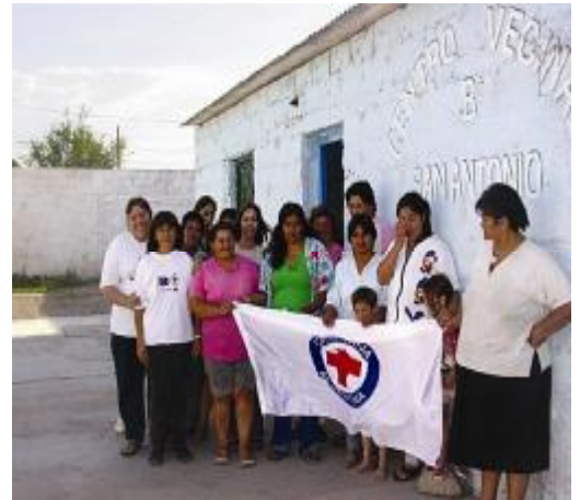
Breaking the silence: Addressing violence against women in Argentina. International Federation.

This report covers the period of 01/01/2006 to 21/12/2007 of a two-year planning and appeal process.