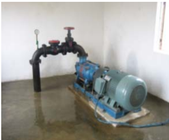
A pump installation in Sangbuk-dong, Mundok county.

and sanitation systems to the communities in November. During the implementation of the programme, the national society's water and sanitation technicians and the Federation's water and sanitation officer have monitored construction on a regular basis and provided technical assistance and recommendations where necessary.