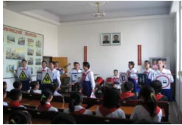
School girls disseminating messages on road safety through performances enacted during “Global Road Safety Day”, 10 May 2007.

Public Health in Emergencies (PHiE): The DPRK Red Cross health coordinator, water and sanitation programme officer, community-based disaster preparedness (CBDP) programme officer and the Federation’s health delegate and health officer attended a regional PHiE training workshop in Beijing. The workshop aimed to improve the public health in emergency preparedness and response capacity of the national society by developing and maintaining a team of health professionals who can be deployed for emergency health interventions in major disasters situations in DPRK and the wider region.