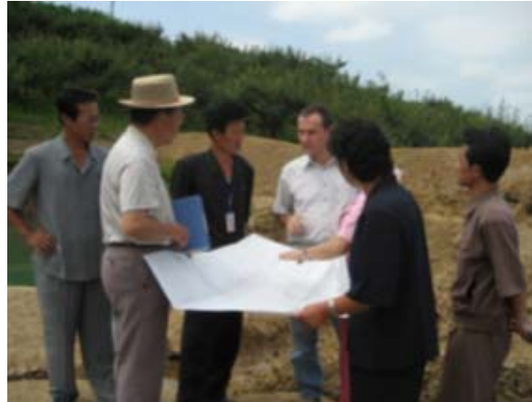
Field assessment to select new target in Songnam farm, Jongju city, North Pyongan Province, 13 July 2007.

Following the workshop, a bill of quantity for an upgrade of reviewed projects was discussed and finalized in June. A request for procurement of construction materials, except for cement and reinforcement steel, was sent to the Netherlands Red Cross international tendering arrangements. Procurement of cement and reinforcement steel was arranged by the Federation delegation through local tendering and the materials will be delivered in late August for immediate construction.