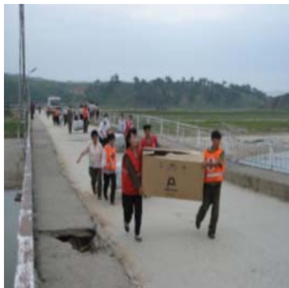
Red Cross volunteers carrying relief items after a Red Cross convoy was disrupted by a collapsed road during the recent floods.

In a world of global challenges, continued poverty, inequity, and increasing vulnerability to disasters and disease, the International Federation with its global network, works to accomplish its Global Agenda, partnering with local community and civil society to prevent and alleviate human suffering from disasters, diseases and public health emergencies.