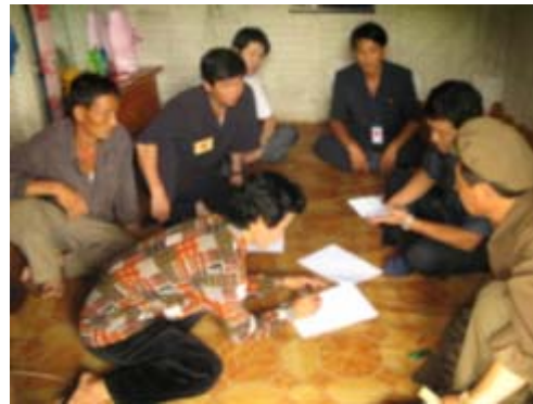
A VCA field exercise in Jangrim Ri, Songchong county, South Phyongan province.

Upgrade of the legal base: Following the adoption of the Red Cross Law of the Democratic People's Republic of Korea by the Red Cross Society on 10 January 2007, the cabinet instituted a regulation on the implementation of the Law on 7 May. The central committee of the DPRK RCS, with a number of members with professional links to the different ministries, sees it as its responsibility to urge relevant stakeholders in ensuring the implementation of the Red Cross Law and the correct use of the Red Cross emblem. In line with the cabinet regulation for the implementation of the Law on Red Cross Society, all health institutions in the country, including hospitals, clinics, pharmacies, vehicles under the ministry of public health have to change the use of the red cross into a green cross.