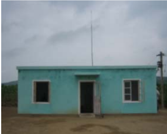
A pump station in Sangbuk-dong, Mundok county.