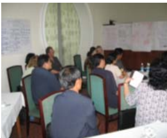
An NSDP review workshop in Phyongsong city, South Phyongan province.

A series of review workshops are being prepared and held in three provincial branches and vulnerability and capacity assessments (VCA) in five communities. Based on the respective NSDP mid-term review reports from all ten provincial branches, the national society mid-term review team will hold consultation meetings with stakeholders to discuss areas of common intervention and support. The first two-day workshop was held in August in South Phyongan province under the guidance of the review team composed of five staff members of the headquarters. The one-day VCA field exercise was held in Jangrim ri , Songchon count. The national society mid-term review report is due in November 2007 to be submitted to the Congress in 2008.