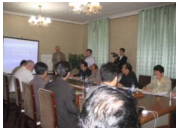
Participants of a water and sanitation workshop on 22-24 May 2007.

and sanitation systems to the communities in November. During the implementation of the programme, the national society's water and sanitation technicians and the Federation's water and sanitation officer have monitored construction on a regular basis and provided technical assistance and recommendations where necessary.