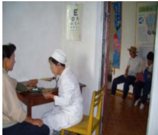
A DPRK RCS and Federation supported clinic in North Phyongan province.

Achievements: The area in which the Federation implements its activities in the DPRK covers 64 cities and counties in five provinces, with a total population of 8.25 million. This is about 40 percent of the population of the DPRK. Unfortunately, Chagang Province (seven counties) and one county in North Phyongan province has been closed to expatriates since November 2006 and the Federation supported programmes for this area have therefore been suspended.