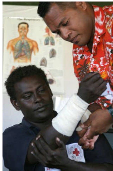
First aid instructors' courses like this one have contributed to the increase in quality and scope of Federation-supported programmes.

Over the last few years there has been much progress particularly in areas such as first aid, HIV/AIDS, blood donor recruitment, and disaster response capacity, and this work will be further consolidated. One of the main challenges for the coming years will be to move towards more community-based programming, in areas such as health promotion, community based first aid, and disaster preparedness, early warning and risk reduction at the local level.