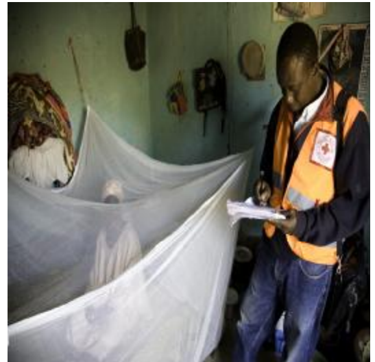
A Red Cross Volunteer supports Hang Up activities in Mali.

This report covers the period of 01/01/2006 to 31/12/2007 of a two-year planning and appeal process.