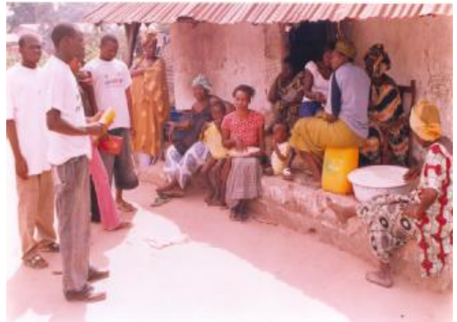
Gambia Red Cross Society volunteers visited houses to promote measles vaccination during the December 2007 campaign which targeted 342.526 children for immunization.

Two hundred and thirty-six volunteers from the Gambia Red Cross Society (GRCS) participated in the measles campaign which targeted 324,526 children in seven regions in Gambia from November to December 2007. The National Society held press briefings, conducted district-level sensitization, broadcasted radio jingles, and carried out house to house outreach during the one week campaign. GRCS volunteers also recorded vaccination registrations, and helped administer Vitamin A and de-worming tablets. Volunteers reached 65 per cent of the target population in rural areas. The role of the National Society was also highlighted by the President of the Republic of The Gambia during his launch speech.