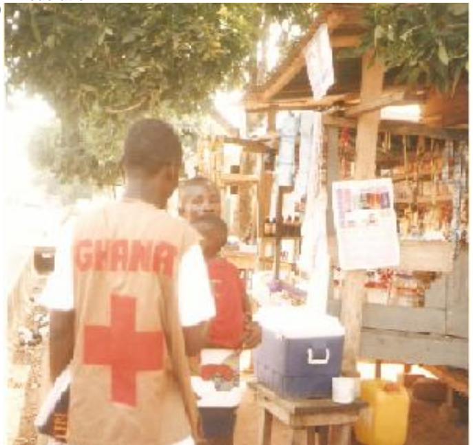
The Ghana Red Cross Society received funds from the Measles and Polio Appeal to participate in their historic 50th Anniversary Maternal and Child Health Campaign. Over 800 GRCS volunteers participated in this campaign. International Federation.

The Ghana Red Cross Society (GRCS) supported vaccination campaigns with funds received from the International Federation in 2006 and 2007. As part of Ghana's 50 th Anniversary, an integrated Maternal and Child Health Campaign, including polio vaccination, Vitamin A supplementation, de-worming tablets and distribution of ITNs was conducted in November 2007. Though its Mother's Club network, GRCS engaged some 800 volunteers who reached out to 905,105 mothers and children in 25 districts of all ten regions. In all, 67,330 households were visited, and volunteers mobilized 195,762 children under the age of five, 22,513 pregnant mothers, 92,094 non-pregnant mothers and 46,492 adult males. As part of the post-campaign exercise, volunteers visited 17,034 households, out of which 7,775 received bed nets. Close to 60 per cent of the 7,775 households with bed nets had their nets hanging during the visit. This campaign was carried out with funds received from the Swedish and Norwegian Red Cross.