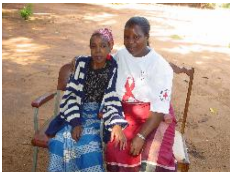
A Red Cross caregiver with a HBC client during a home visit.

The Red Cross societies in southern Africa have made considerable progress on modes of care and support for PLHIV and OVC. By 2005, there were 99 HBC projects and over 5,000 volunteers and their families had been trained to provide basic nursing care to clients. Approximately 50,000 PLHIV and 100,000 OVC received support from the Red Cross societies. The care, treatment and support interventions provided by Red Cross care gives addresses nursing care, emotional, spiritual, psychological, social and material needs of PLHIV and their families. Key to this is the imparting of skills and coping strategies to their family members through household training.