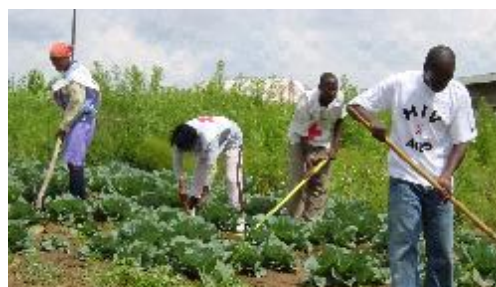
A Red Cross care facilitator assists a support group in tending their vegetable garden in Lesotho

The emphasis will be equally on improving the quality of service delivery at the same time as scaling-up. This will benefit from stronger partnerships at all levels including with WHO, the World Food Programme (WFP), the Joint United Nations Programme on HIV/AIDS (UNAIDS), Office for the Coordination of Humanitarian Affairs (OCHA), UN's Food and Agriculture Organization (FAO), the United Nations Population Fund (UNFPA) and Regional Psychosocial Initiative (REPSSI) of the United Nations Children's Fund (UNICEF). Educational, material, psychological and social support for children will increase.