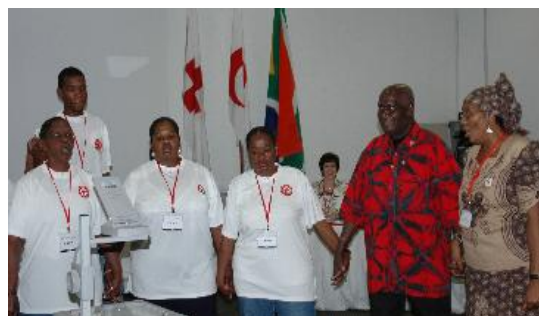
Red Cross volunteers with former Zambia's president – Dr Kenneth Kaunda– at the HBC Symposium held in April 2006, Johannesburg, South Africa.

Red Cross societies have already developed their volunteer policies and are working on modalities for improving the management of volunteers. There is therefore a need to support national societies in adjusting to new forms of volunteering and youth work given the challenges in volunteerism that the region is facing. The work of the volunteers in the region was recognized at the regional HBC Symposium held in April 2006, where the Federation regional delegation gave awards to volunteers from all national societies as a token of appreciation. Their work, commitment and challenges were publicized, leading to considerable media and donor attention.