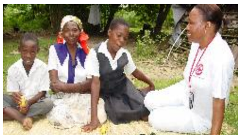
A Red Cross care facilitator during a home visit in South Africa.

Prevention strategies will include the groups most at risk of infection, such as commercial sex workers, truck drivers, in and out-of school youth, correctional services inmates and workers, military personnel, guardians/grandparents of OVC and men who have sex with men. They have a critical role in stemming the rate of HIV spread.