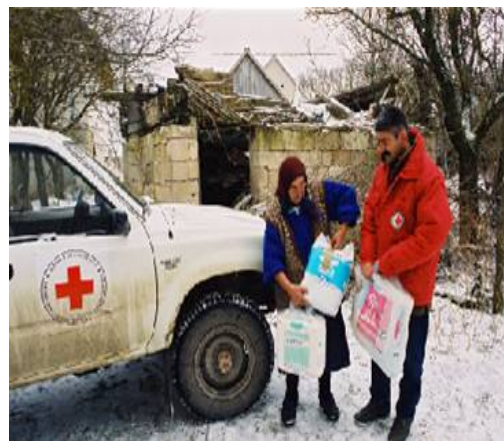
The Red Cross Society of Bosnia and Herzegovina's mobile technical team making a home-visit in Bosansko Grahovo.

This report covers the period of 01/01/2006 to 31/12/2007 of a two-year planning and appeal process 2006-2007.