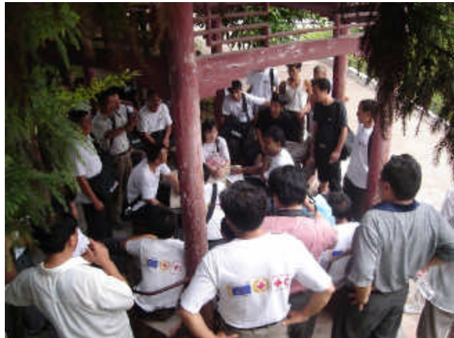
In Hunan, village volunteers and Red Cross representatives gather to discuss methods of participatory education, which are part of the Red Cross' integrated, community-based programming.

In China, it is reported that natural disasters destroy an average of 4,182,000 houses per year, with some four million people resettled or transferred from their homes every year. Government statistics show that these disasters account for 80 to 90 per cent of the substantial economic losses – an average of RMB 100 billion (CHF 159 million) – suffered annually. While the government is quick to respond in an emergency phase, it cannot come close to meeting the needs of the country's reported 370 million people affected by natural disasters every year. Assistance and support from the RCSC and Federation is therefore critical in providing for people made vulnerable by disasters. Access to clean water and adequate sanitation is another key challenge in China, remaining an obstacle for achieving the MDG target for environmental sustainability. Over the next few years, the disaster management programme will prioritize the improvement of the national society's disaster management capacity in accordance to international standards. It will have the impact of strengthening RCSC capacity to provide quality response to common disasters facing the country, while reducing the vulnerability of disaster-prone communities in three provinces through integrated community-based water sanitation, health education and disaster preparedness activities.