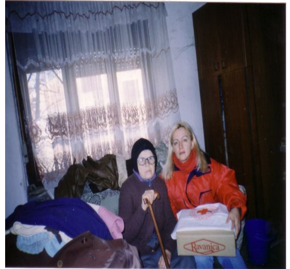
A beneficiary of the home care programme in Vrbas, Serbia, receiving a parcel provided by a local donation.

This report covers the period of 01/01/2006 to 31/12/2007 of a two-year planning and appeal process.