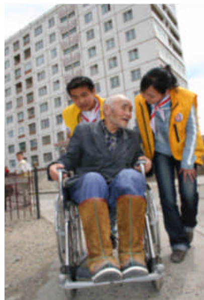
Photo: An elderly citizen shares a few words with MRCS volunteers who give him much needed care and support.