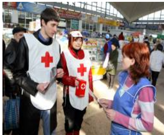
Young volunteers distribute leaflets about HIV and collect money in Belgorod market.

This report covers the period of 01/01/2006 to 31/12/2007 of a two-year planning and appeal process.