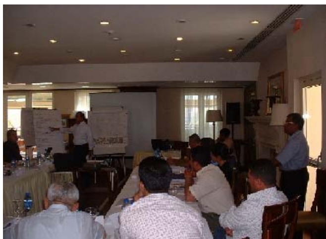
The National Societies of Palestine, Jordan and Israel were present at the earthquake preparedness training held in August in Ankara, Turkey.

MENA zone organized an earthquake preparedness training for Palestine RC, Magen David Adom (MDA) and Jordan Red Crescent in Ankara during 8-12 August 2008. The training was facilitated by the Asian Disaster Preparedness Centre (ADPC) and supported by American RC. A tentative technical agreement was reached among the participants on building up a joint earthquake contingency plan between Palestine RC and MDA.