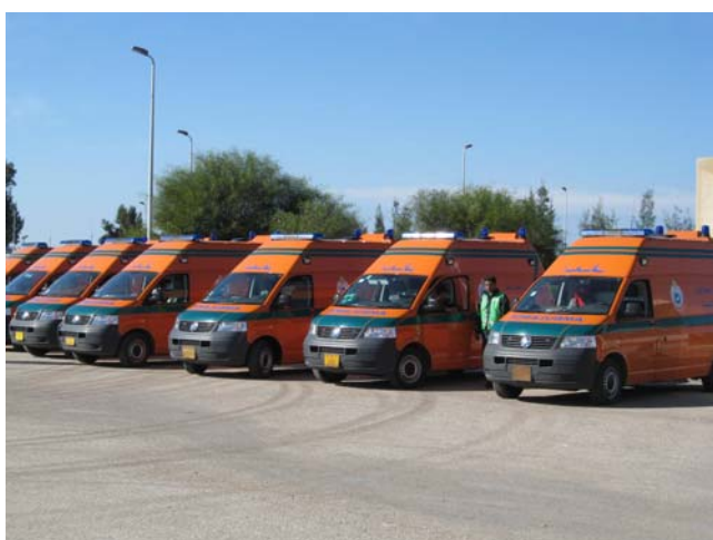
During the Gaza conflict, the Rafah crossing point was equipped with ambulances in order to facilitate the entry of medical supplies and the transportation of wounded people from Gaza to Egypt.

In response to the floods in Yemen, the International Federation mobilised regional resources to incorporate into the FACT, including the regional disaster management coordinator from Amman, and logistics delegates from the Lebanon and Jordan representations. With the National Society's request, the International Federation also established contact with representatives such as the Yemen ambassadors in Geneva and Amman.