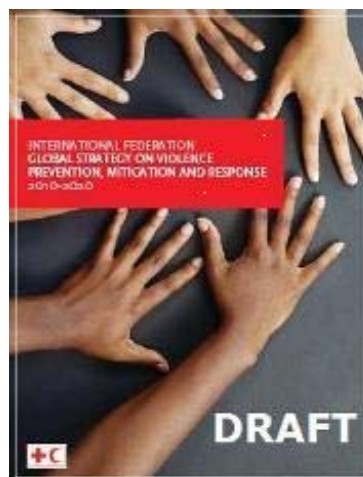
Global Strategy on violence prevention, mitigation and response. IFRC

This report covers the period 1 January to 31 December 2009.