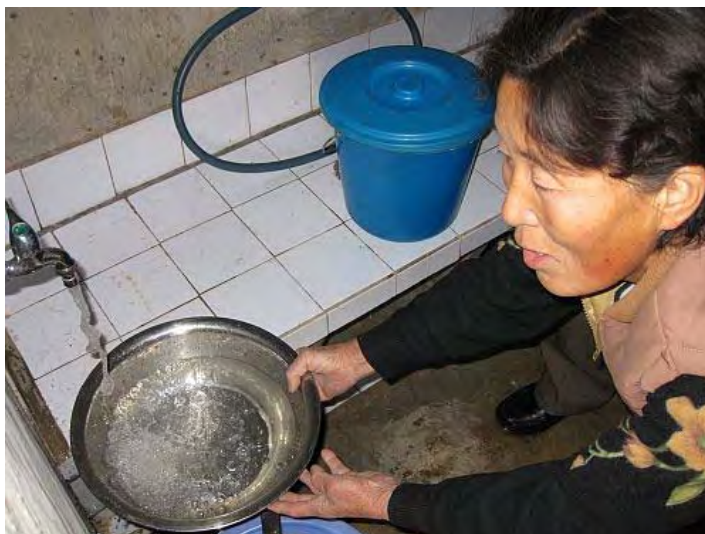
Health facilities and beneficiaries report a significant decrease in water-borne diseases thanks to the provision of safe drinking water at household level, like above in Myongam ri Cholsan county North Pyongan province.

The construction of 15 water and sanitation schemes started mid-2008 were completed in 2009. The DPRK Red Cross and IFRC officially handed over the projects to 15 communities targeting approximately 49,000 beneficiaries in South Hamgyong, North and South Phyongan provinces. Clean tap water is now piped into approximately 12,000 households, and an additional 1,000 ventilated improved pit (VIP) latrines and 6,035 soak pits were constructed.