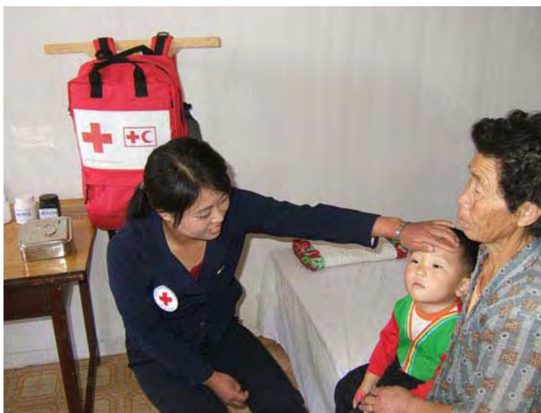
This first aid post in Suhung ri, Hamju county, South Hamgyong province is one of 2,500 first aid posts the Red Cross is supporting in the entire country. The volunteers who run the posts on a daily basis receive regular first aid training and six months of first aid supplies. The first aid posts play an important role in the prevention of diseases thanks to continuous health and hygiene promotion, as well as in the treatment of injuries, which can sometimes be life saving.

to refill 2,500 first aid kits for 2,500 first aid posts throughout the country. A total of 40 Red Cross trainers and 400 volunteers were trained as trainers in CBFA in 2009. First aid posts and volunteers play an important role in the prevention of diseases thanks to continuous health and hygiene promotion, as well as