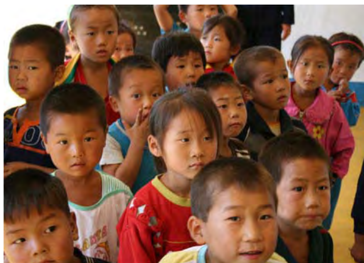
The refurbished children's nursery in Sinsong-ri, Kumya county, South Hamgyong province now counts with proper bathing and kitchen facilities through the integrated community development project (ICDP).

This report covers the period 1 January 2009 to 31 December 2009.