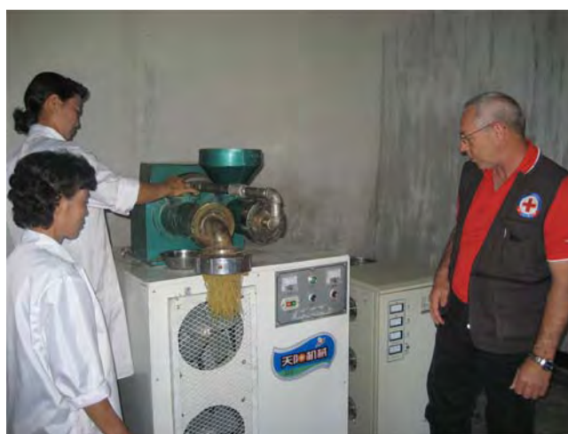
The procurement of food processing machines, like this noodle pressing machine in Sinsong ri, Kumya county, South Hamgyong province, helps the most vulnerable people in the community generate additional income.

To maximize the impact of the ICDP project, and to enable additional support for the two pilot