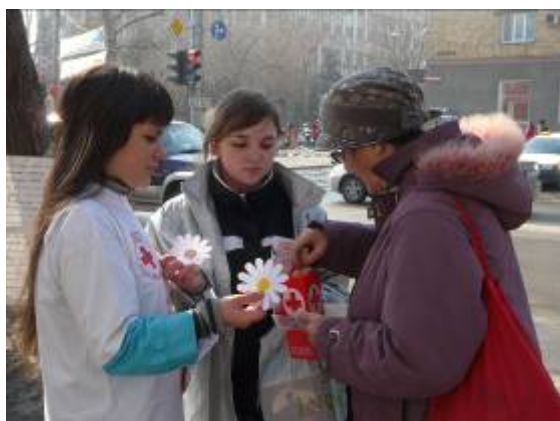
White Camomile action on World TB Day in Abakan.

About 1,500 TB patients received psychosocial support that included individual and group sessions with TB patients and their family members. In addition, long-term psychosocial support was provided to the TB patients to help them accept their TB diagnosis, and to set up internal motivation and adherence to treatment and recovery.