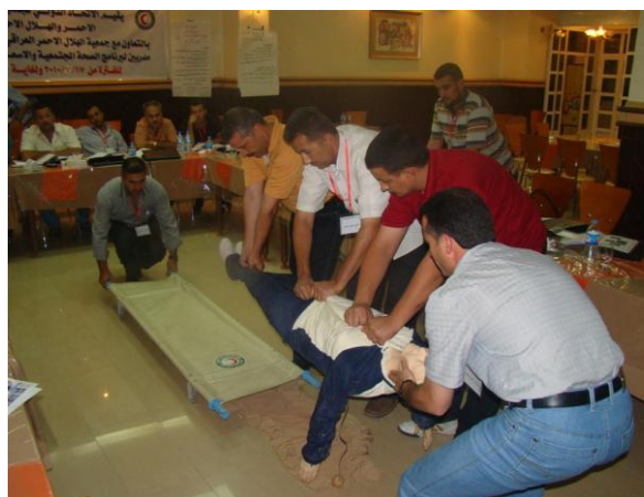
In July a community based first aid trainer of trainers course was held for volunteers and staff of the Iraqi Red Cross Society in Suleimanya governorate.

This report covers the period 1 January to 30 June 2010.