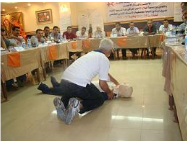
In August, the International Federation conducted its second CBFA trainer of trainers course for the volunteers and staff in Suleimanya governorate.

The community based health and first aid (CBHFA) programme identifies local capacity and vulnerabilities. The new curriculum for the school project included health promotion, health education and healthy behaviours in addition to first aid knowledge. To achieve a balance between the new concept of the CBHFA school and the capacity of the Red Crescent volunteers, the International Federation ran three trainer of trainers courses. It had been felt that some branches were lacking well trained volunteers due to the, at times, weak communication between the National Society and its volunteers.