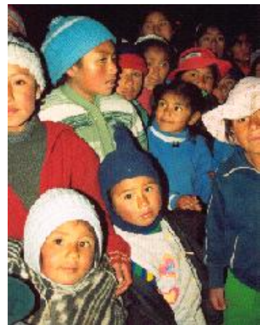
46 children under the age of five have died from respiratory illnesses as a result of the cold weather.

The cold wave is mainly affecting areas located 3,800 metres above sea level. The most recent figures indicate that 92 people have died as a result of this extreme weather, including 46 children under the age of five who have died from respiratory illnesses. This weather is also causing the loss of crops and other natural resources, which will have a long-term negative impact on the