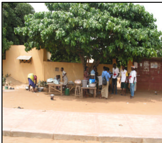
Togolese Red Cross volunteers conducting house-to-house sensitization activities

Nigerian Red Cross Society provided tents which were transferred in a coordinated response between the Nigerian Red Cross, Federation Sub-regional office and ICRC Lagos office; this demonstrated effective sub-regional collaboration and support.