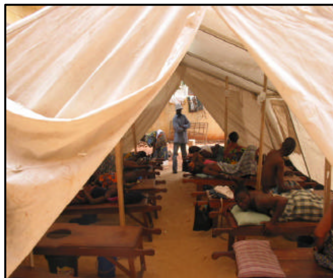
Togolese Red Cross tents were used as emergency treatment centres