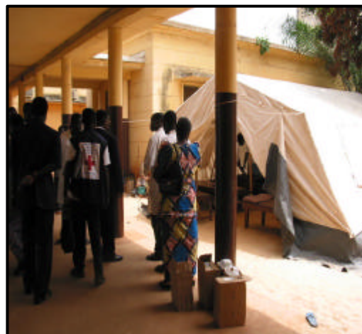
Togolese Red Cross was a key partner in responding to the cholera epidemic

Volunteers were active in house-to-house sensitization, and sensitization to the general public in markets, churches through the media (particularly the TV and community) radios in French and local languages. Togolese Red Cross organized a press conference with the Health Co-ordinator and produced a short television documentary highlighting the volunteer activity. Information, Education and Communication (IEC) materials including 10,000 leaflets and 400 posters with essential messages were reproduced and distributed, a stock remains available and samples have been shared regionally.