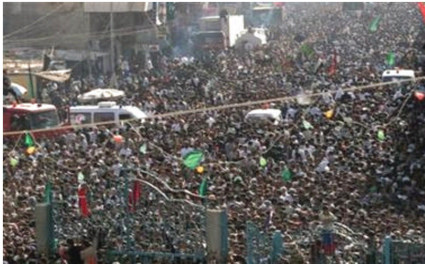
The massive crowd near the Shrine's Gate

The Iraqi Red Crescent Society (IRCS) was quickly into action. Fifty volunteers were dispatched to the area within minutes of news of the tragedy. They were backed by seven vehicles (two ambulances, two trucks, two 4WD and a minibus). The volunteers administered first aid on the scene to some of those most in need. The initial team was soon joined by backup. A first aid centre was set up on-site. As injured people were ferried to various hospitals, the IRCS sent 1,000 blankets to Al-Nu'man, Medicine City and Baghdad Nursing House hospitals. The below photographs capture some of the scale and horror of the scene.