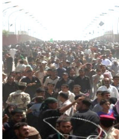
Over the Bridge