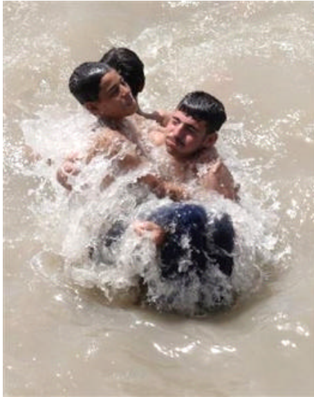
In the River