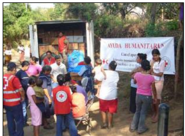
Distribution of relief items on 23 December

Activities that have taken place have been in charge of the National Relief Department which, in line with the National Response Plan, has offered support at the local level by mobilizing NIT members from the Santa Ana Branch, relief items, power equipment, telecommunications equipment and other items. Visibility and equipment of volunteers in the Branches of Atiquizaya y Santa Ana need to be improved in order to increase their operational capacity.