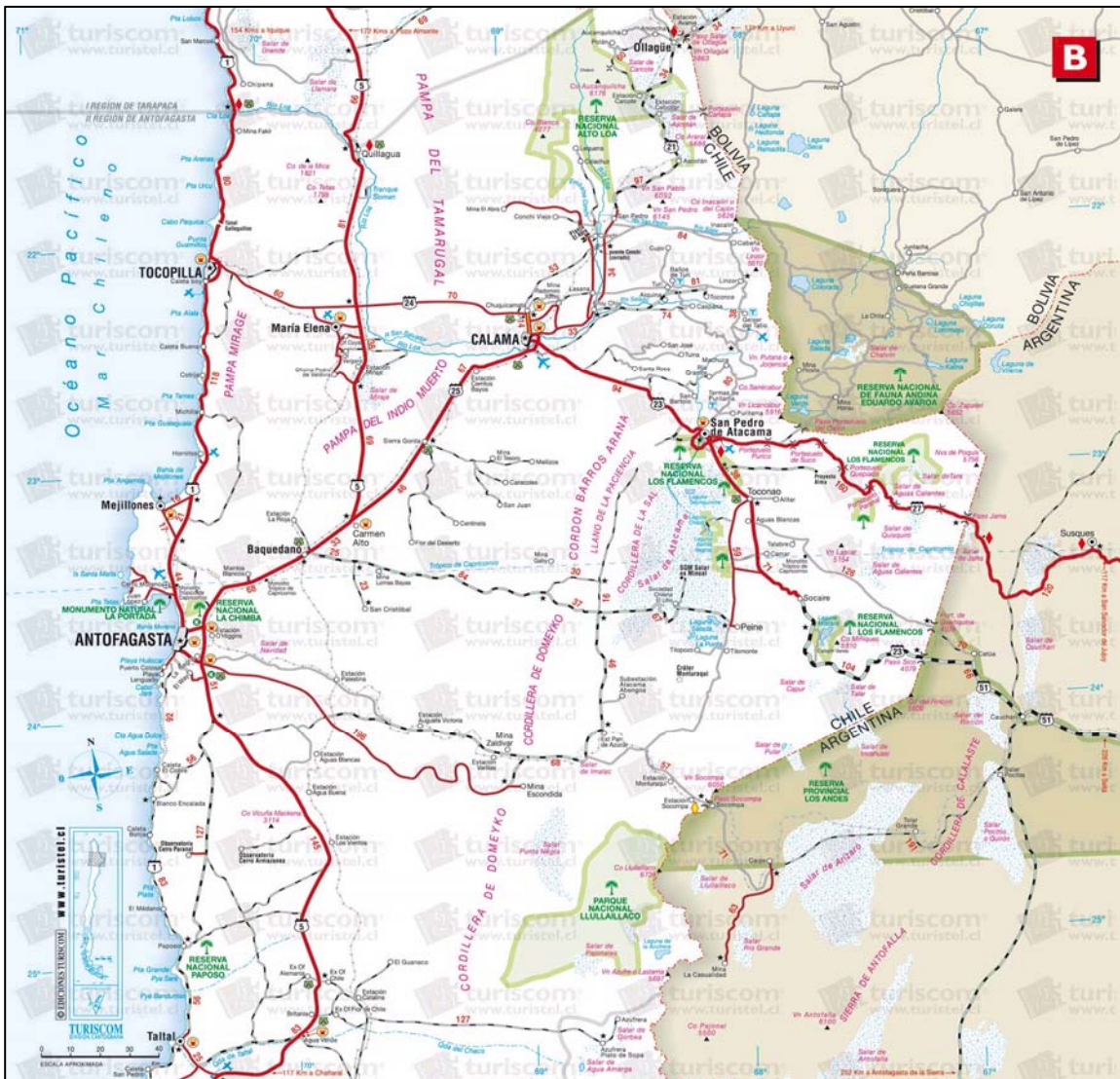
Map showing the epicentre of the earthquake in Northern Chile.

The towns of Tocopilla and Maria Elena were the worst affected, with populations of 24 thousand and 7 thousand respectively. Two lives were lost in the town of Tocopilla, and 115 people were injured, of which 89 women, 19 male and seven children.