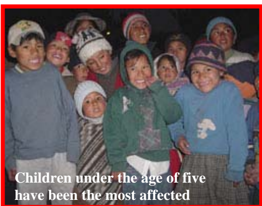
Children under the age of five have been the most affected

Schools in the departments of Ayacucho, Huancavelica, Junín and Arequipa have modified their schedules in an attempt to avoid exposing the children to the harsh weather during the coldest hours of the day. At the same time, the government is considering the temporary evacuation of the population living above 4,000 meters from sea level, with the purpose of protecting them from the climatic inclemency.