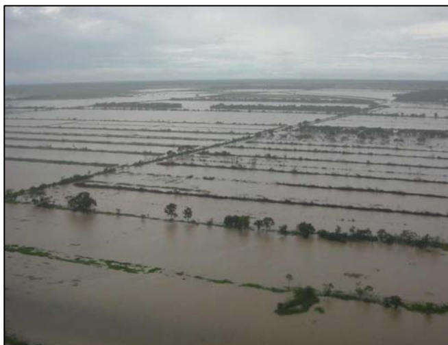
Heavy rainfall led to floods, which subsequently caused the devastation of many crops in the department of Santa Cruz.

the president declared a state of emergency (a red alert) on 21 January, in order to assist the affected people. The Civil Defense is managing the situation.