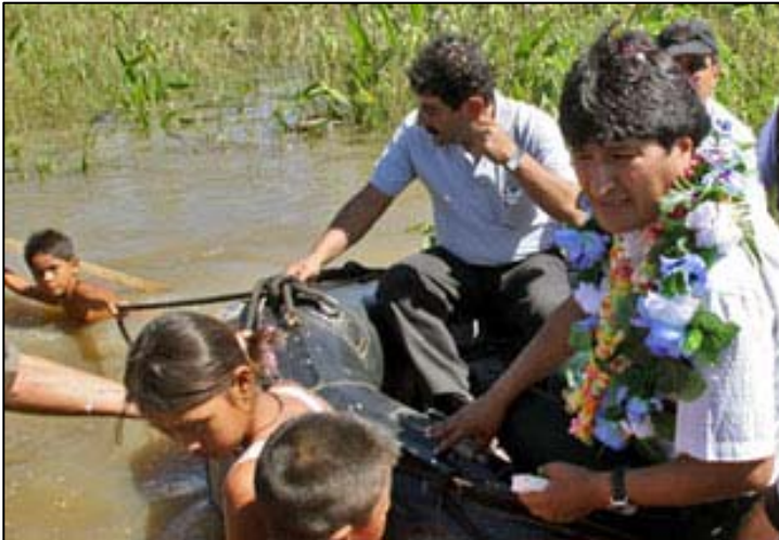
The President of Bolivia (right) toured some of the areas which have endured months of flooding.

In the department of Tarija, the Rio Bermejo overflowed and swept away sugar plantations. In the department of Chuquisaca, several houses have collapsed and roads are blocked. In Oruro, hail destroyed crops and the high water levels of the Desaguadero River affected several communities.