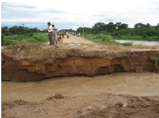
This road close to Pailon had to be opened, in order for the Rio Grande to be drained.

<click here for contact details> <click here to see a map of the affected areas>